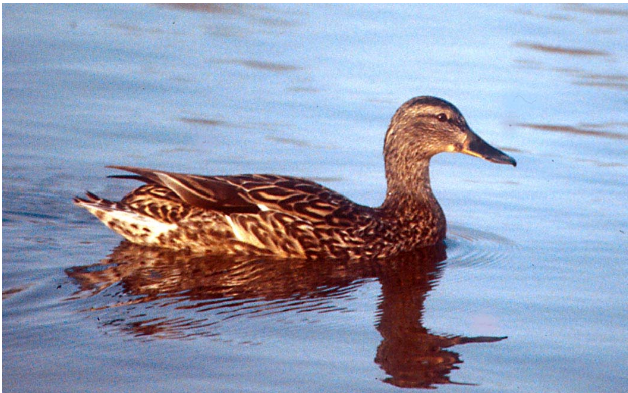
Male Mallard duck (top) and female Mallard duck (bottom). Mallards stop by in Tripps Run and Four Mile Run in Falls Church in the Fall and Spring. Some may stay for the summer.